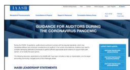
IAASB Guidance for Auditors During the Coronavirus Pandemic