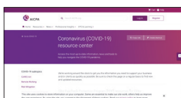
AICPA Coronavirus (COVID-19) Resource Center

Access COVID-19 Resources by clicking on the images below