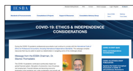
IESBA COVID-19: Ethics & Independence Consideration